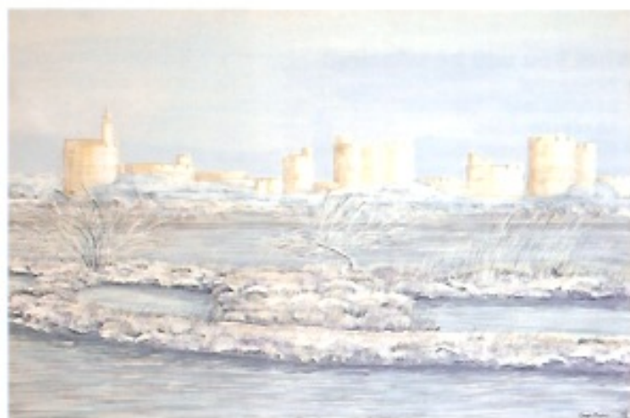
BLUE II Acrylic on Canvas (Textured paste with pallet knife)